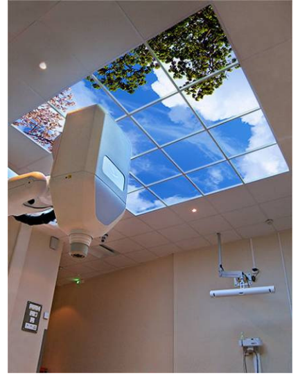
Baclesse Radiotherapy Center France