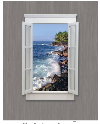
Sky Factory eScape

A Sky Factory Luminous SkyCeiling will be on display at ESTRO, along with the new Sky Factory e Scape <sup>™</sup> digital cinema virtual window. e Scape brings the dynamic beauty of nature – image, motion and sound – to interior environments. Each e Scape installation features 10 hours of original high-definition nature content captured with leading-edge RED Digital Cinema<sup>™</sup> technology. The pristine, real-time nature scenes are displayed through a commercial-grade HD LED monitor, and include tropical ocean views with dramatic surf, sunrise and sunset, waterfalls, rivers, lakes, wildlife and underwater marine life.