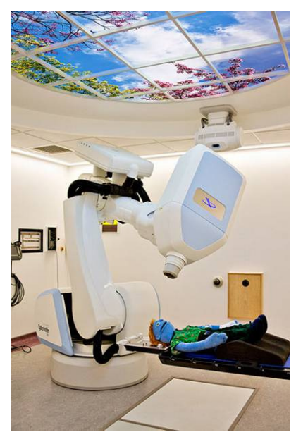
The Royal Marsden Cancer Centre United Kingdom

The Royal Marsden is a world-leading cancer centre specializing in cancer diagnosis, treatment, research, and education. The facility is constantly raising standards to better serve the 40,000 cancer patients from across the UK and abroad that are seen each year. In the recently added CyberKnife® Robotic Radiosurgery System suite in the London facility, leading-edge technology is used to treat cancer while a