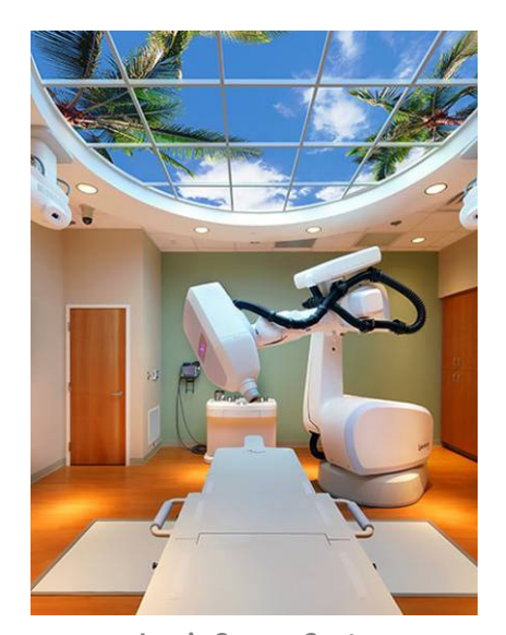
Lewis Cancer Center United States

Evidence-based design (EBD) research indicates that illusions of nature promote healing and reduce the use of pain medications in healthcare settings. Radiology applications include all therapeutic and diagnostic environments.