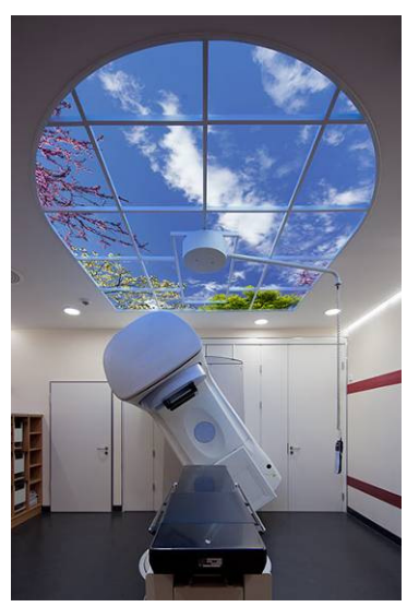
University of Leipzig Hospital Germany