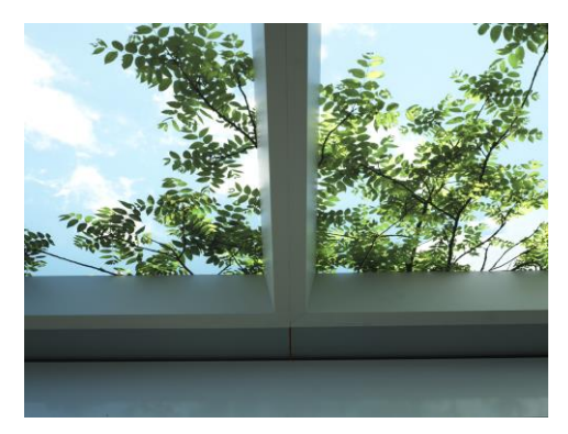
Larger image panels draw the eye upward

This key distinction, to compose the visual content within the context of the space, is among the 20 or so design parameters that play a pivotal role in