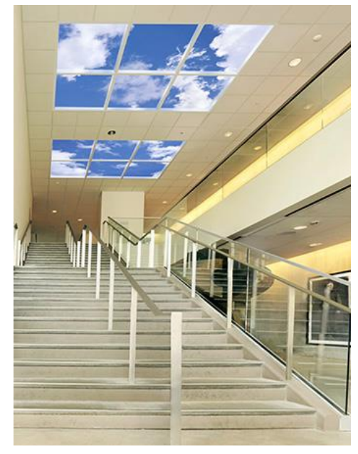
2015 Winner in the Ceiling Finishes category