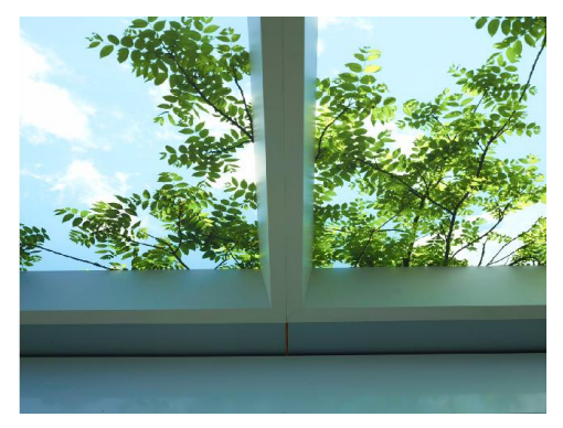
Larger image panels draw the eye upward

At the same time, the linear direction of reveal modified the was from а rectangular design (90 degrees) to a softer, wider angle (106 degrees) that is also much deeper (2.75" vs. 1.25" or 69.8 mm vs. 31.75 mm), effectively forcing perspective and leading the mind to a more engrossing 'view' of virtual sky.