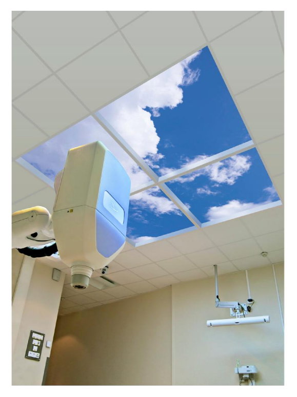
Scale comparison of the Revelation SkyCeiling 4' X 4' image tiles alongside standard 2' X 2' acoustic ceiling tiles

Virtual skylights designed as biophilic illusions of nature <sup>m</sup> are used by leading healthcare and commercial environments worldwide to trigger an automated relaxation response in the physiology. This experience enhances human wellness and task performance by enlivening our innate connection to nature – biophilia .