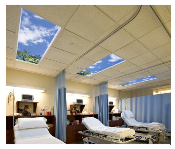
The Personal Revelation SkyCeiling mitigates patient stress and anxiety.

Sky Factory's illusions of nature have been studied by Texas Tech University's Neuroimaging Institute and the results published in the peer-reviewed Health Environments & Research Journal (HERD), winter, 2014.