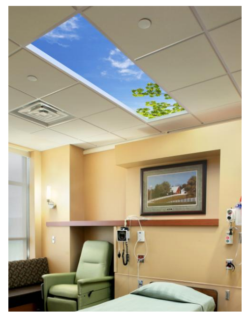
Personal Revelation SkyCeiling